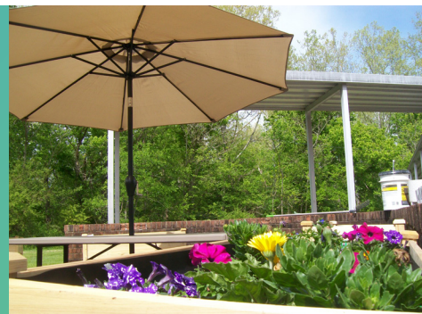
The grant allowed for seating and flower beds to be bought for the outdoor space.

tionality of the school, but it also provided students with invaluable project management, teamwork, and community engagement experiences. The students who undertook this project showed both inventiveness and attention to detail, which are both necessary when transforming an outdoor area. To create a space that was both aesthetically beautiful and functional, they placed each picnic table, planter, and umbrella with care. Their business drive is evident in the fact that they also took care to incorporate components that might be used for fundraising. In addition to the physical advancements made, this endeavor not only benefited the school but also the pupils. The student volunteers were able to develop a sense of community and camaraderie by cooperating to achieve a common objective. They gained important experience in project management, teamwork, and planning, all of which are abilities that are useful outside of the classroom. Thus, this project's success is a testament to what is possible. This initiative is an outstanding illustration of the strength of community and teamwork, and its effects will be felt for many years to come.