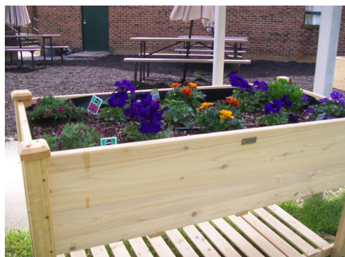
These flower beds are placed around the edges of the seating area.