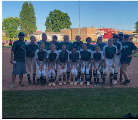
Above: Last year's CHS softball team poses for a picture at the end of the season.