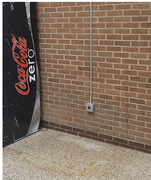
All that remains now is a blank space beside the rest of the vending machines